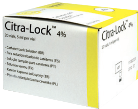
Boxes contain 20 x 5ml vials